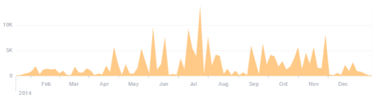
Chart 2: Facebook reach 2014