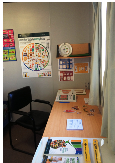
On site diet consultation room